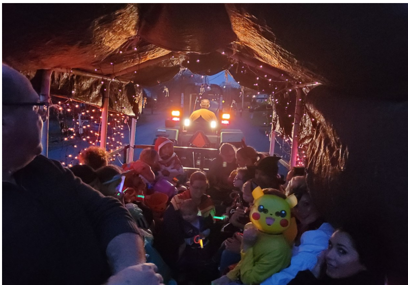
HE 88 Wagon at Halloween Party for Children October 31, 2019