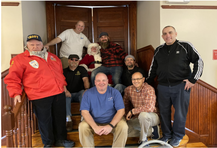
HE 88 PANCAKE BREAKFAST December 2019