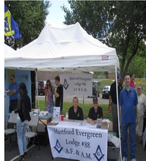
HE #88 CHIP EVENT