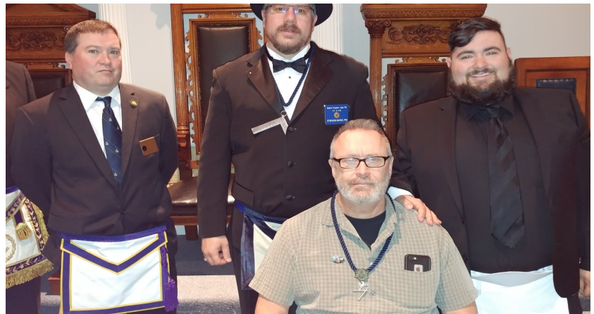
WIDOWS SONS MM DEGREE