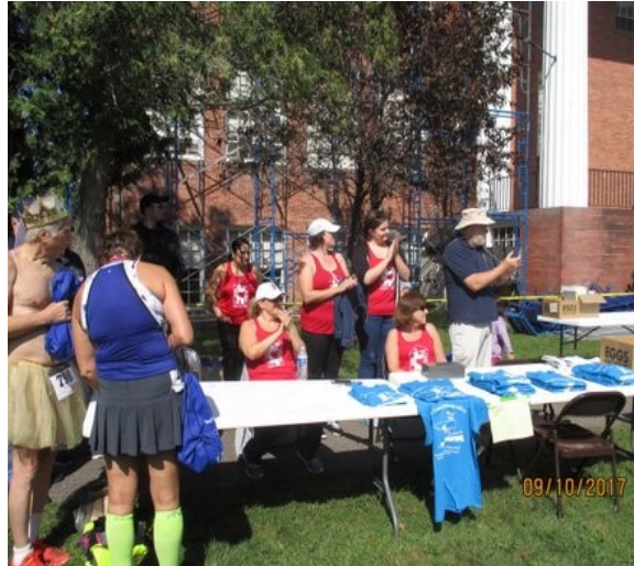
2017 BISSELL FERRY 5K FUN(D) RUN