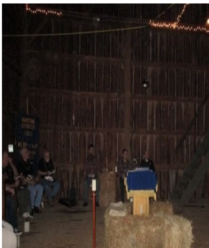
HE #88 BARN DEGREE