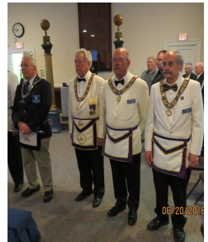
Grand Lodge Officers at INSTALLATION December 17, 2016