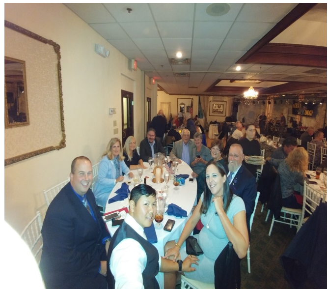
Harvest Moon Dinner and Dance October 2016