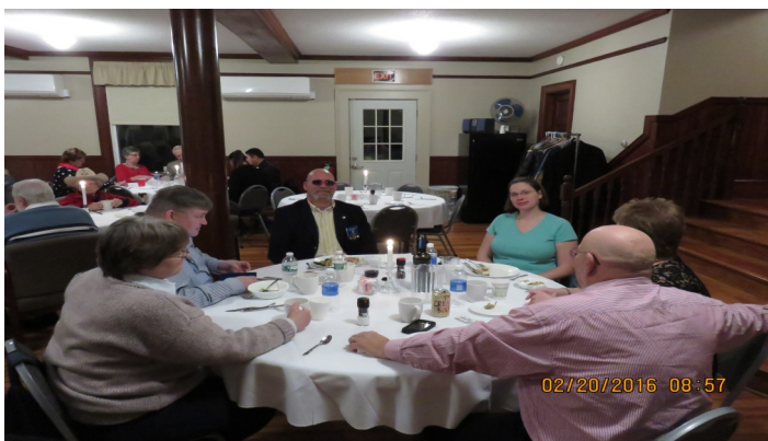
LADIES AT TABLE (February 2016)