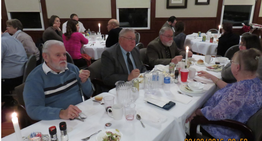
"Ladies At Table" February 2016 (and Gentlemen LOL)

Hartford Evergreen Lodge # 88 A.F. & A.M.