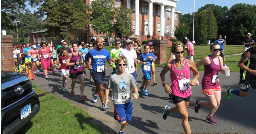
2015 Bissell 5K in South Windsor