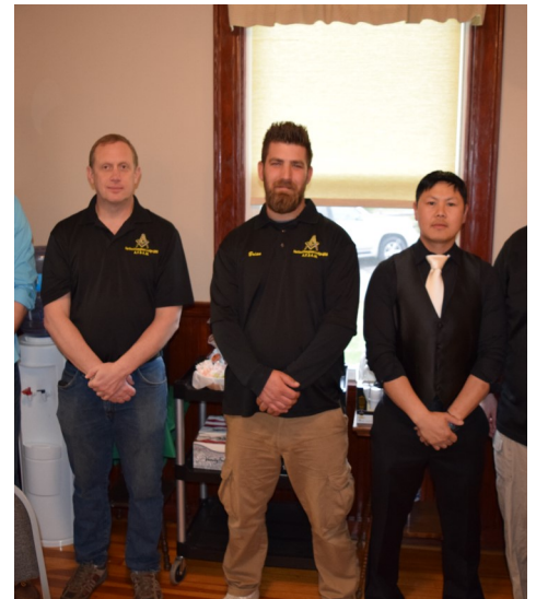
HE #88's "Youth and Energy"

“As the year 2016 is underway, it is a pleasure to see increased attendance at Lodge. It is really nice when Brothers can get together and socialize. Masonry is much more than just a Stated Communication meeting. This year I would like to promote our Lodge and take part in more community events. I would like to do this by hosting the CHIP program. We have been invited to attend several events already, and I am looking for Brothers to help me out. We have had some great press lately, and I would love to see this continue. May we always meet on the level. See everyone at Lodge.”