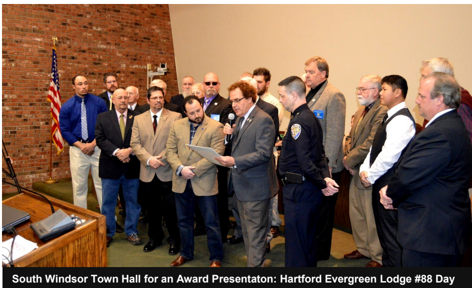
South Windsor Town Hall for an Award Presentaton: Hartford Evergreen Lodge #88 Day